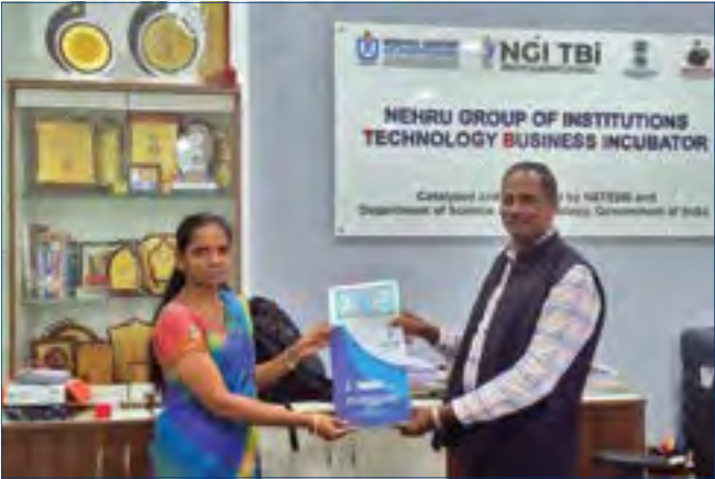
MOU WITH NGI TBI