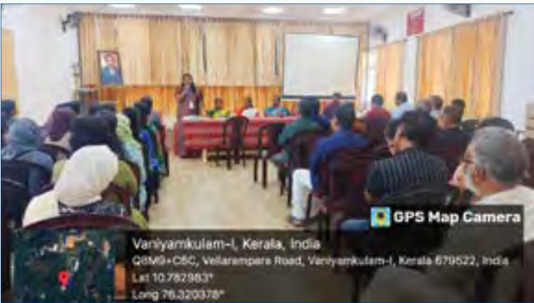
Parents Teachers Meeting- 2025