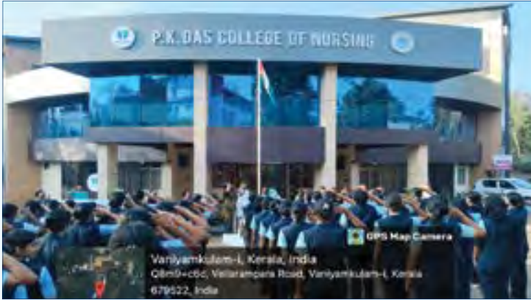
Republic Day 2025