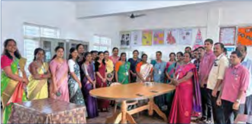
New Year Celebration 2025