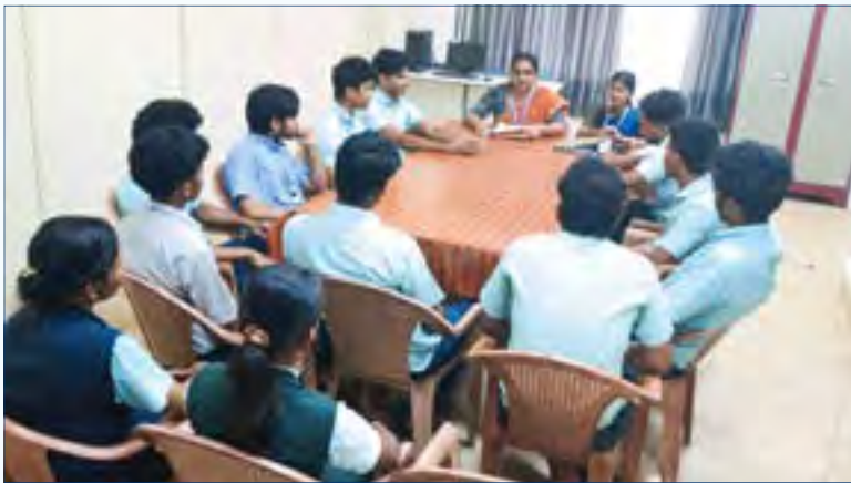
Student Nurses Association Executive Committee Meeting.